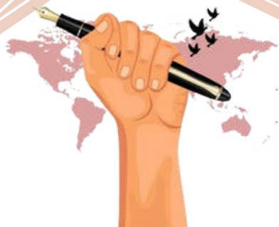
Press freedom index