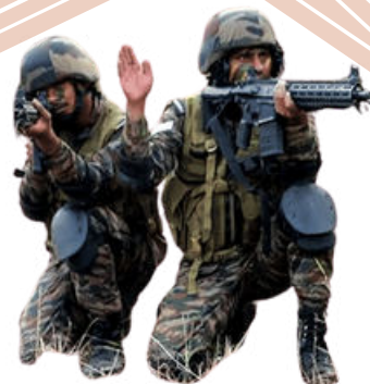
Exercise Mitra Shakti