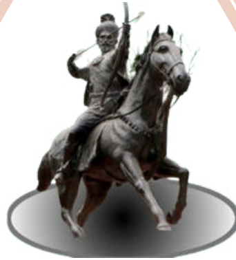
जननायक बांसिया चरपोटा